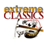
100 Best Books